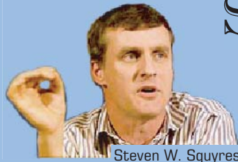
Steven W. Squyres