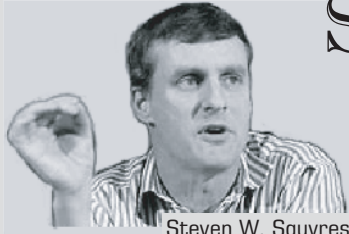
Steven W. Squyres