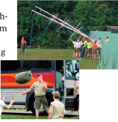
Here are some highlights from the long unpacking process!